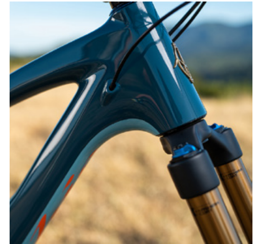
37mm Fork Offset