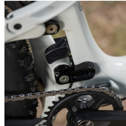
2.6" Tire Clearance