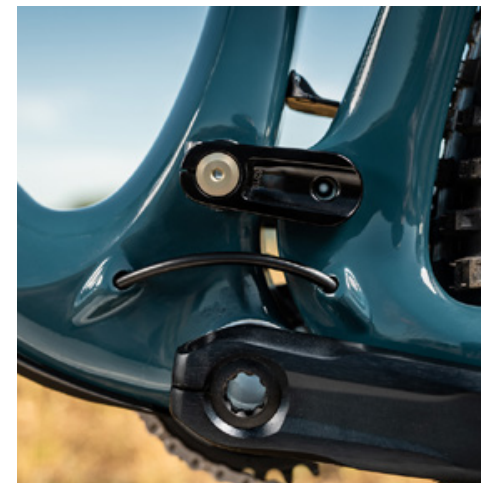
Bushing Lower Link